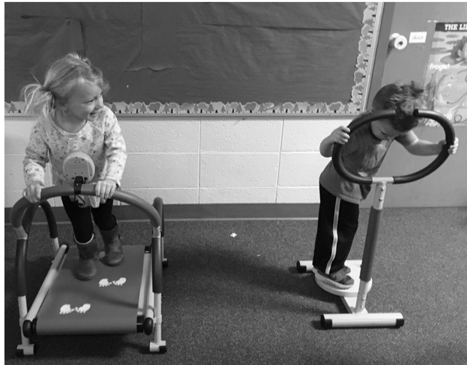
Photo: Preschool room exercising when large motor space not available.