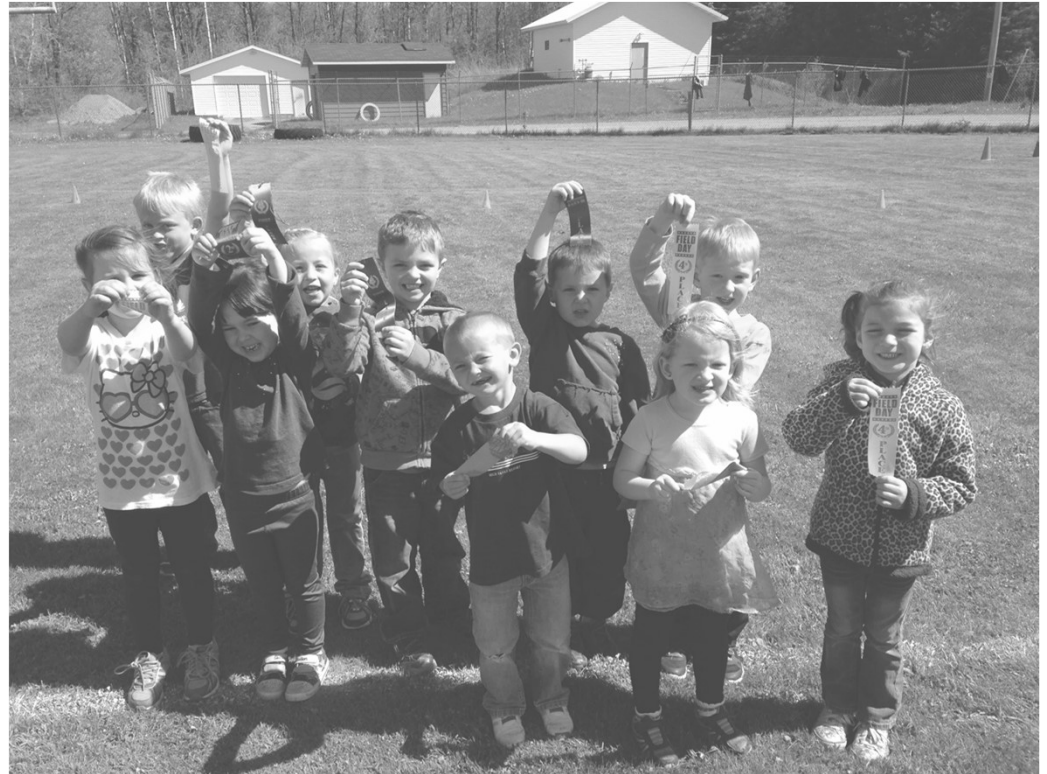
Photo: Four year olds at Little Olympics

Contract provides a reimbursement rate of $23.50 per child, per day of attendance. A day consists of a minimum of 4 hours. The program must run 4 days/week, 32 weeks/year.